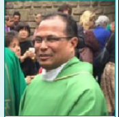
Jubilee Mass September 2019